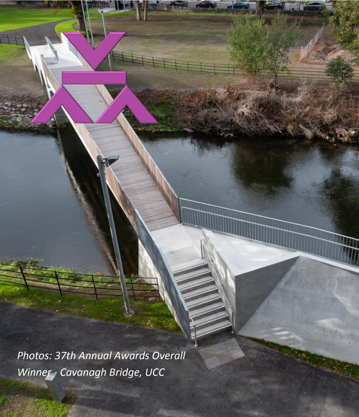
Photos: 37th Annual Awards Overall Winner - Cavanagh Bridge, UCC

The Irish Concrete Society is a not for profit learned body established in 1973 to support and encourage excellence in the use of concrete.